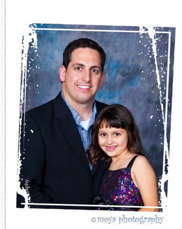
3x9 Notepad set of 3 $25