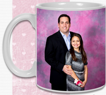
Ceramic Mug 11 02. $24